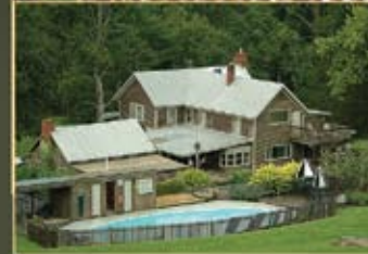
FARMHOUSE INN AND COZY COTTAGE